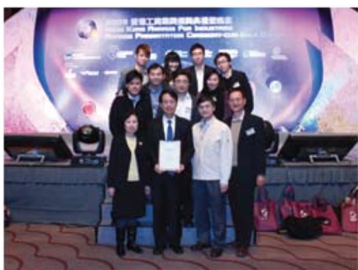
HKAI Awards Presentation Ceremony, 2010