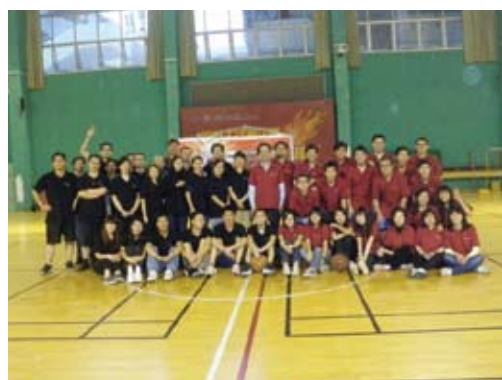
ACS Cup Basketball Competition, 2010