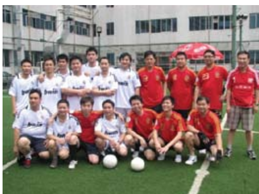
ACS Cup Football Competition, 2008