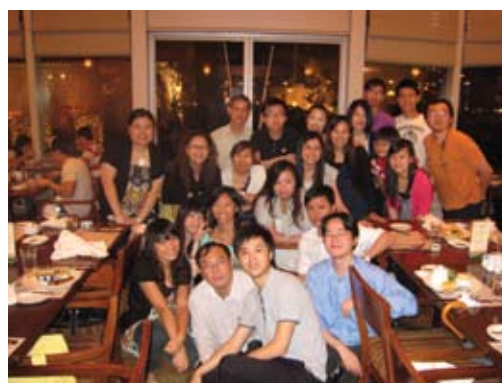
Buffet Dinner, 2009, Hong Kong

Advanced Card Systems Ltd. (ACS, wholly owned subsidiary of Advanced Card Systems Holdings Ltd., SEHK: 8210), founded in 1995, is Asia Pacific's top supplier and one of the world's top 3 suppliers of PC-linked smart card readers, as well as the winner of the Product Quality Leadership Award for Smart Card Readers from Frost & Sullivan. One of two hundred firms in Forbes Asia's 2010 Best Under a Billion list, a prestigious list of 200 top-performing firms selected from close to 13,000 publicly listed firms in Asia Pacific, ACS develops a wide range of high quality smart card reading/writing devices, smart cards and related products and distributes them to over 100 countries worldwide. Visit ACS at http://www.acs.com.hk