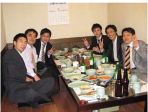
Meeting with clients, 2008