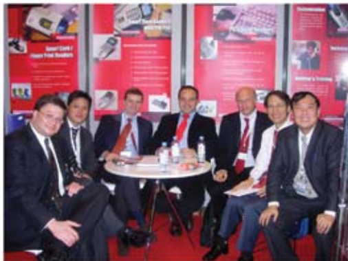
Cartes 2005, Paris, France