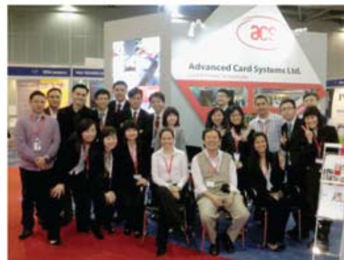
Cartes in Asia 2010, Hong Kong