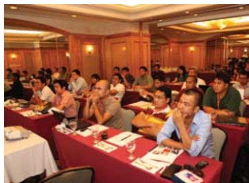
Smart Card Training, 2010, Manila